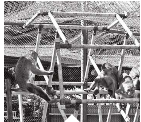
NONHUMAN PRIMATES USED IN MEDICAL RESEARCH

Monkeys are often involved at the later stage of the process—what is called translational or applied research. Here all of the knowledge accumulated earlier is applied to specific medical questions such as: Will this vaccine protect a pregnant woman (and her baby) from Zika infection? And is the vaccine likely to be safe?